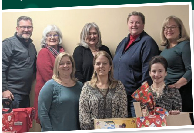
The staffs of the Waukesha County Community Foundation, and the Women and Girls Fund partnered to sponsor four kids for Christmas 2021.

She added that 2021 produced "quite a few first-time sponsors who told me they had never heard of us before and were excited to get involved to help someone in their community." Of the 843 sponsors in 2021, 324 were new sponsors – another record.